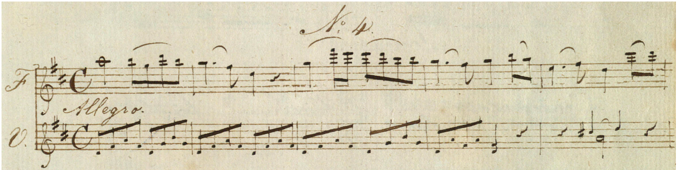
Verzeichniss über Zwei Hundert meiner Compositionen