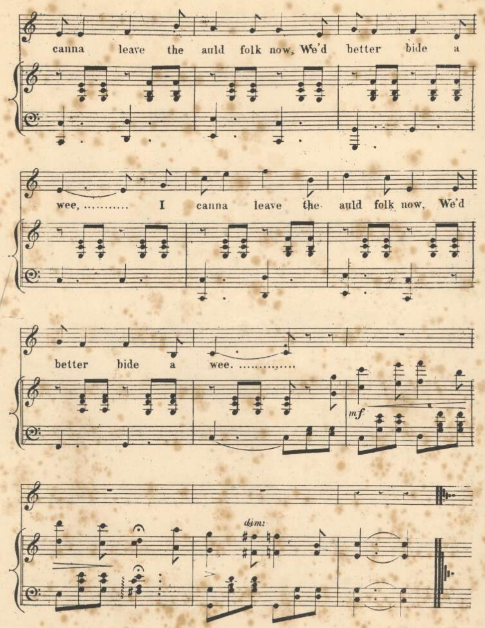
"We'd better bide a wee?"