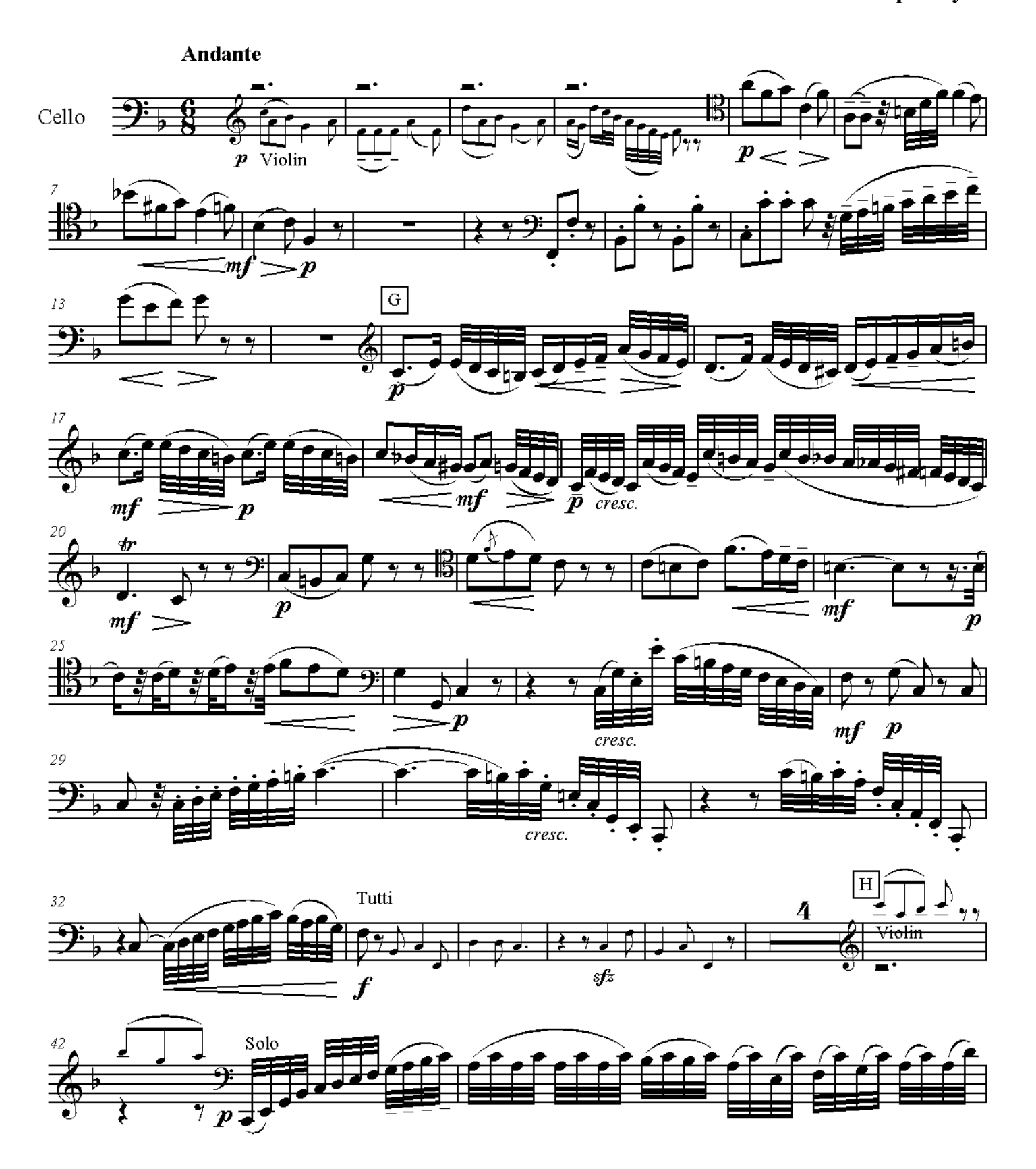
Transcription donated to the public domain 2011, Tom Potter